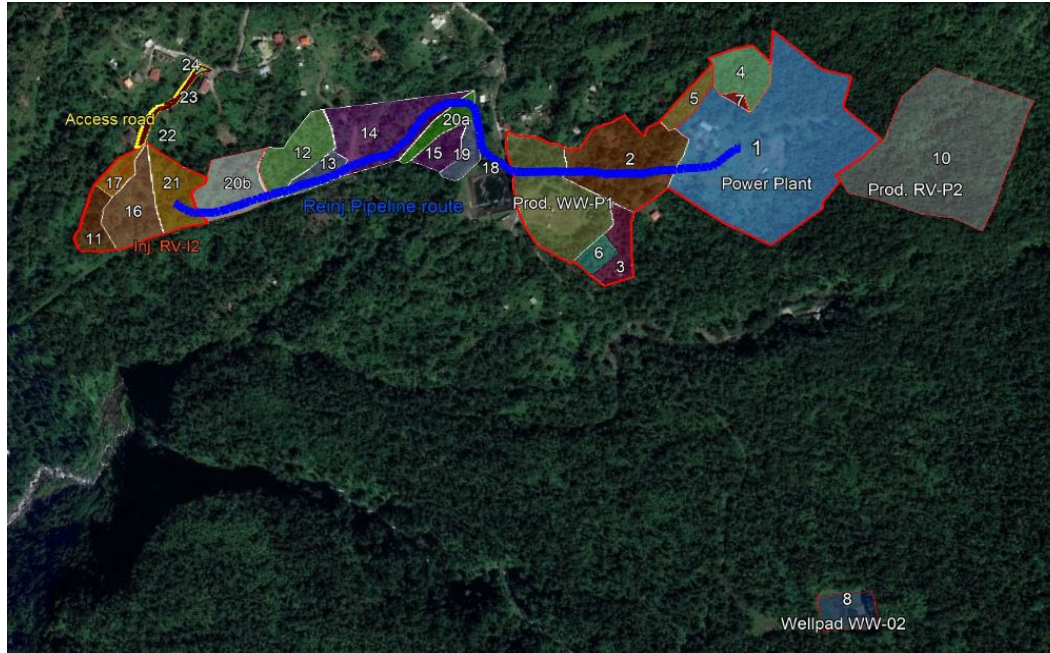
FIGURE 1 MAP OF PROJECT AFFECTED PROPERTIES

Figure 1 provides an illustration of the location of lands owned by PAPs.